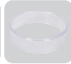
Injection PC diffuser