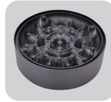
Die casting heatsink