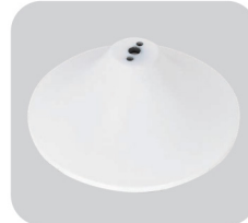
Die casting reflector